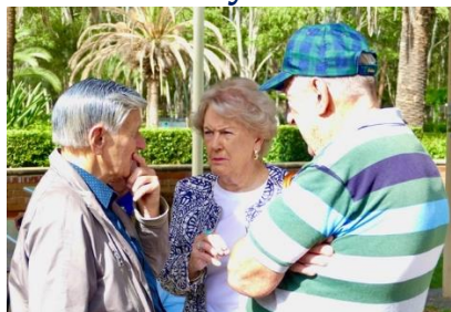
I've been watching the biscuits, it's one each!