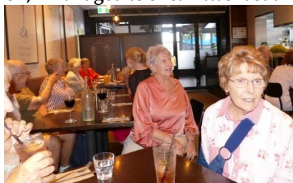
Oh! Is it time to eat again? Goody!