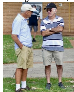
Well, I managed to sneak two last time!