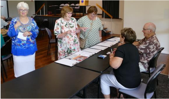
Lower fourth handing in their homework!