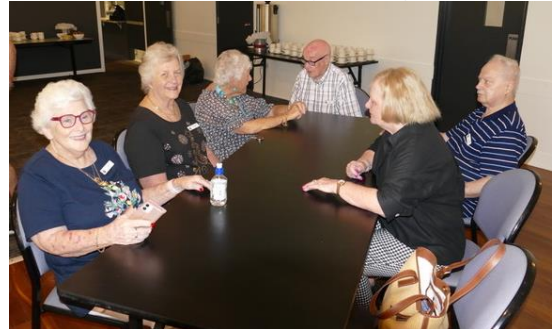
The Kindergarten table!