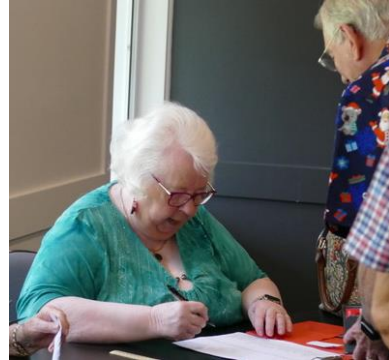
That's the third detention you've got this week!