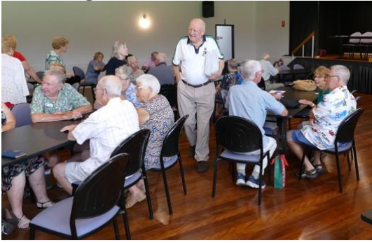
The High School Principal strolls through the canteen!