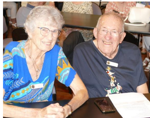
Prefects for 2024!