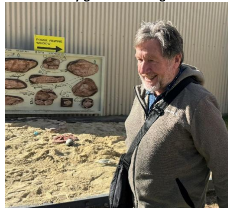
From one old fossil to another!!