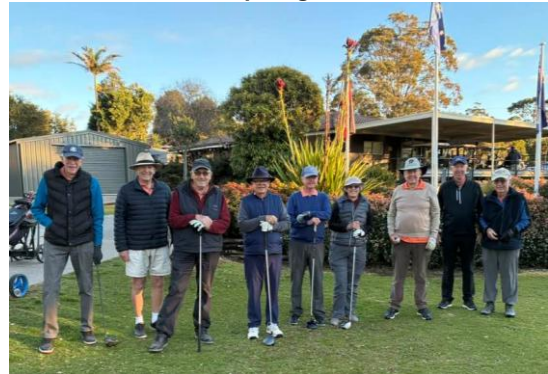
The scruffy golfers braving the cold