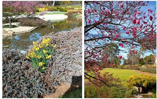
Beautiful gardens at Cowra