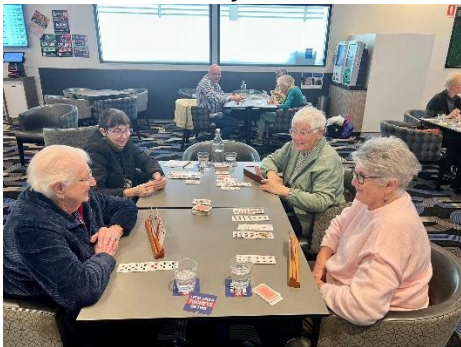
Gamblers Anonymous (even if it's only for points!)