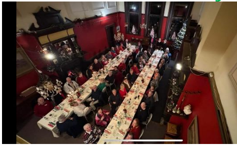
Christmas at Abercrombie House – the banqueting hall