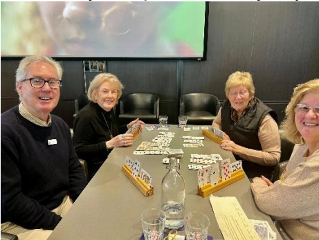
Everyone's a winner baby, that's for sure!