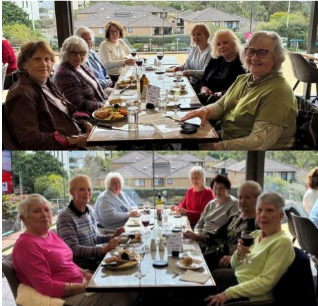
The Sunday Lunchers