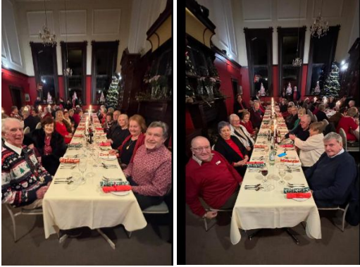
Eagerly awaiting the feeding troughs to be filled!